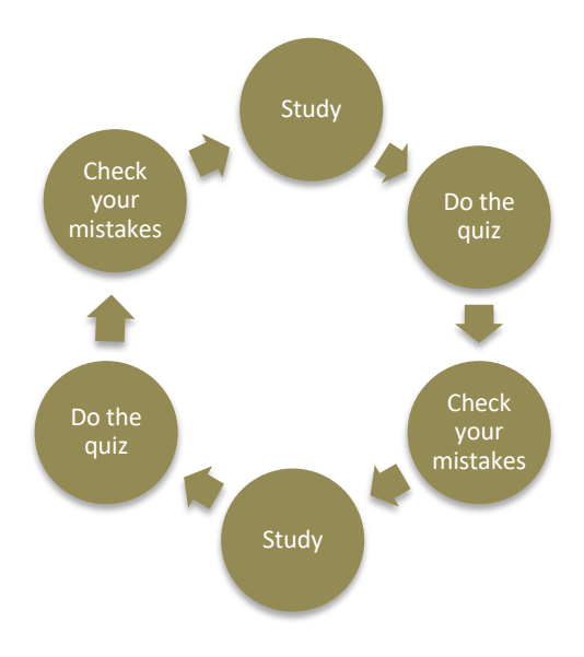
Fig. 3. The recommended study cycle

Homework for the English Medical Terminology textbook was set up on Moodle. The textbook contained eight sections for each semester. The class met 15 times a semester. The teacher assumed that the students had had little or no previous experience of e-learning. As the classes were scheduled in a regular classroom, during the first class, the teacher showed screenshots and distributed a handout explaining how to enter information into the user profile and how to use the system in general. At the same time, students were also advised on different learning and note-taking techniques and encouraged to follow the study pattern shown in Figure 3.