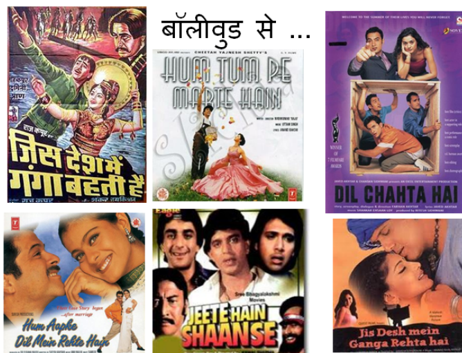
Fig. 1. Present imperfective tense in Hindi film titles

The Bollywood titles in the posters read: